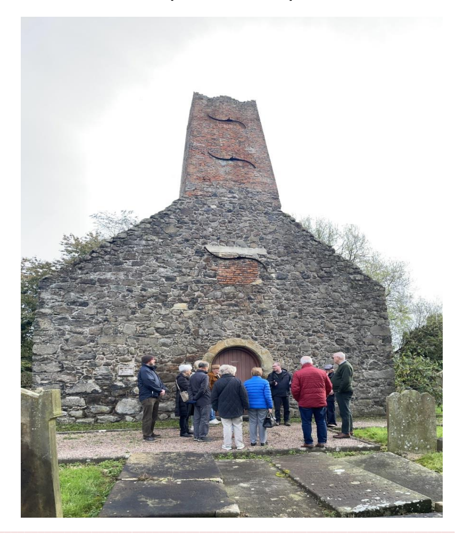
Page 6 of 12