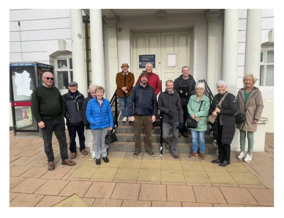
Family and Local History Group – On the Walking Tour (above and below)