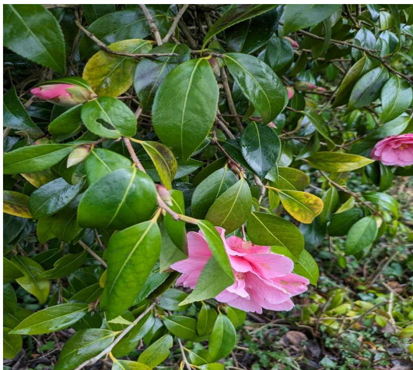
From last month: a day out at Downhill